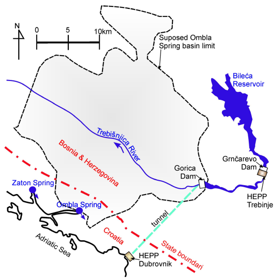
Fig. 2. All Figures